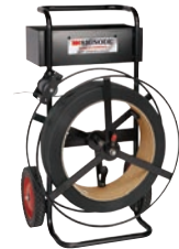
DF-X An all purpose, easy loading dispenser for mill wound coils.