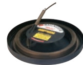
DF-23 Fits almost anywhere. Pays off from the inside of the coil. Mobile with optional DM-23 cart. Cover required for strap over 0.023" (0.58mm). Cover sold separately (Part No. 024219).