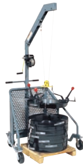
Portable model Part No. 424700

Capable of lifting up to 125 lb. strap coils, the standard coil lifter is designed for easy dispenser loading, both vertically and horizontally. Accommodates both mill and ribbon wound steel strap coils as well as standard plastic coils.