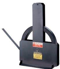
DH-1-34, DH-1-114, DH-1-2 For use with heavy-duty strapping.