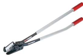
Model CU-25LH Part No. 0X-1528 Extra long handle cutter. Replaceable blades. Cuts strap through 2" x 0.050" (50.8 x 1.27 mm). Shipping weight: 8 lbs. (3.6 kg)