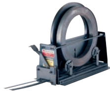
DC-1A Built-in strap cutter for pre-cutting. Holds any two ribbon wound coils.