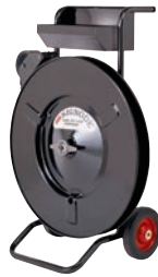
DF-10RW Accepts mill wound or ribbon wound coils 3/4" and 1-1/4" in width.