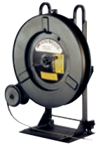
DF-1-12 For power equipment only. Dancer arm of coil and brake. Base sold separately (Part No. 024360).

* Dispenser can be used with both steel and plastic strapping