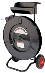
DF-15 For typical shipping room. Easily loaded with mill wound coils.

** Makes the DF-23 mobile. (Part No. 017000)