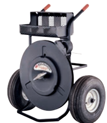
DT-1-10RW Heavy-duty dispenser. Ideal for outdoor use in rough terrain.