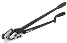
Model CU-25 Part No. 005740 For strap removal or cutting strap to length. Replaceable blades. Cuts strap through 2" x 0.050" (50.8 x 1.27 mm). Shipping weight: 8 lbs. (3.6 kg)