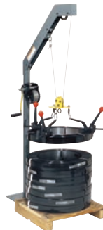
Stationary model Part No. 425650