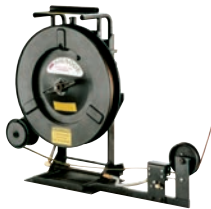
DP-1-12R Pneumatic reversing dispenser. Generally for power strapping machines with large chute systems.