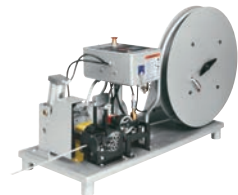
DPCL Cuts strapping automatically up to 100 ft. in length.