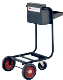
DM-23 Makes the DF-23 mobile.