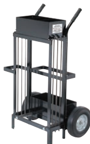
DTR-3 Heavy-duty carloading. Rubber tires for easy mobility. Holds one coil 3/4", two coils 1-1/4", and one coil 2" strapping.