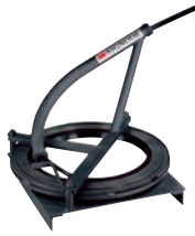
DA-34-114 Heavy-duty dispenser. Pays off from inside of coil.