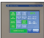
▲ Control panel

Provides a wide range of flexibility, accommodating quarter-packs, half-packs and long loads. The BPX's highly intuitive, user-friendly HMI allows for machine preprogramming so operators don't have to interrupt production to change load specifications. Plus, the HMI provides quick and easy diagnosis of service-related issues.