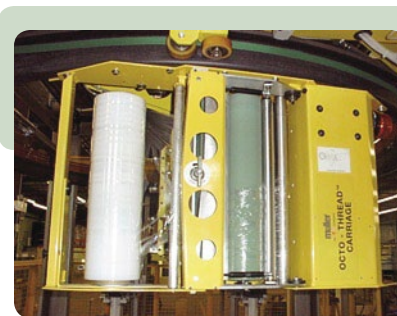
Octo-Thread film carriage

With its rear opening film loading gate, the Octo-Thread film carriage allows for fast, easy and safe film threading. The standard tilting film mandrel allows the operator to load a film roll with greater ease. It also reduces the risk of damaging the film roll during loading.